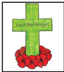
William Weatherup age 5

THESE HOLIDAYS: EASTER, MOTHER'S DAY, FATHER'S DAY, HALLOWEEN, CHRISTMAS, AND VALENTINE'S DAY.