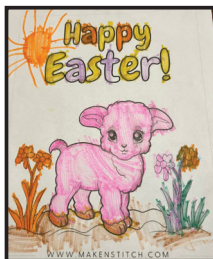
Charlie Kent, age 5

THESE HOLIDAYS: EASTER, MOTHER'S DAY, FATHER'S DAY, HALLOWEEN, CHRISTMAS, AND VALENTINE'S DAY.